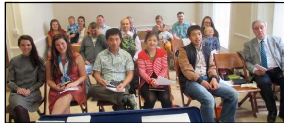
Limerick Reformed Fellowship

I am "between series" at the moment. I finished the "Nativity and Childhood of Jesus Christ" series on April 17 ("The Boy Jesus about His Father's Business"), then I preached some sermons on anxiety (especially 3 sermons on Matthew 6:25-34), and now I am preaching some sermons on the miracles of Jesus, which is evolving somewhat into a series. In Heidelberg Catechism preaching, I am treating the names of the Mediator (Jesus, Christ, the only begotten Son of God, our Lord).