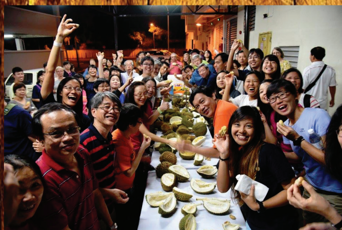
Durian party on the last night of camp!