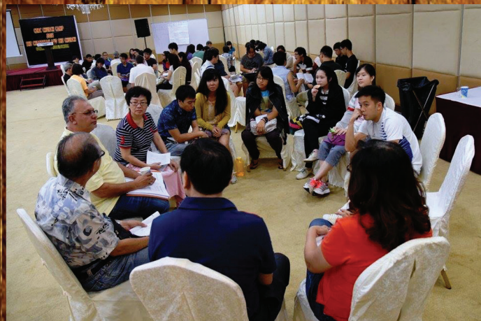
Group discussions after each speech