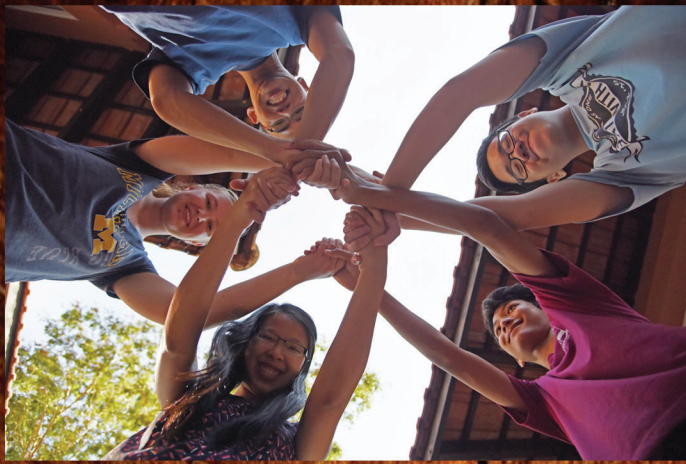
Playing "Group Untangle"