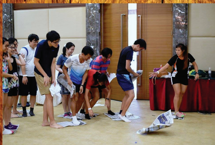
Team games: search the room for clues while traveling on newspaper!