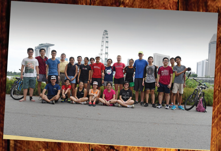
En route to Marina Barrage on a cycling trip!