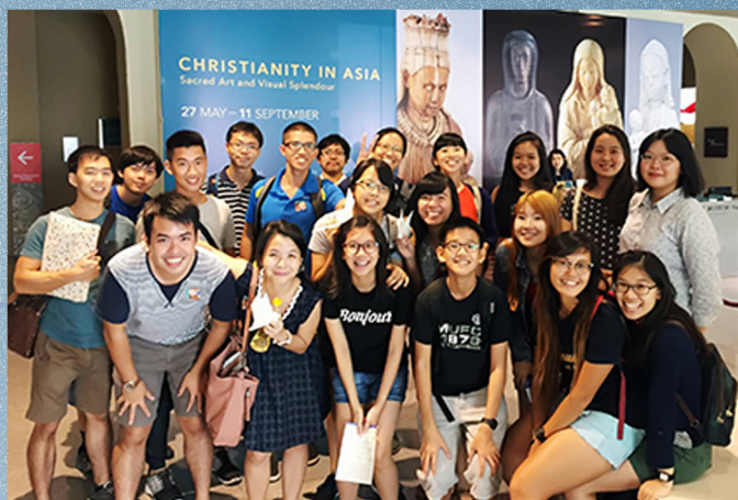
Covenant Keepers outing to the Asian Civilisations Museum for an exhibition on "Christianity in Asia"