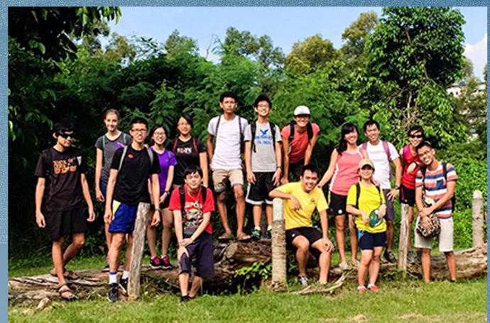
Another Covenant Keepers outing - this time to Tampines Eco Park