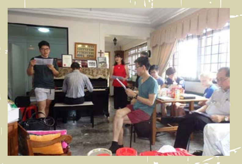
Chinese New Year gathering