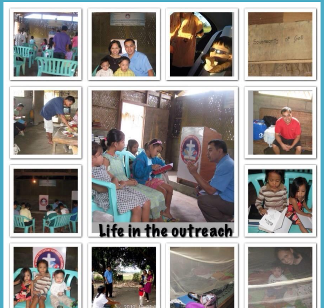
Life in the outreach

We covet your prayers for our brothers and sisters in this part of our country. We do not know what lies for them in the near future if we will consider the possibility of closing the work there for lack of fruit in terms of men that would be qualified for the office of Elders and Deacons.