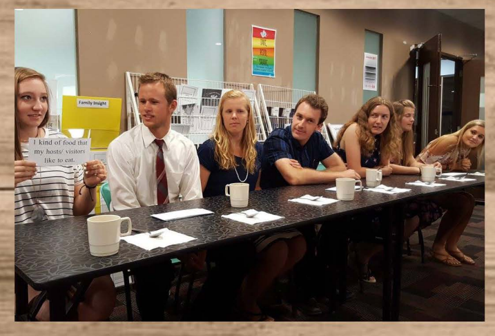
Farewell Sunday for our American visitors, who got to savour a local dish for every question answered wrongly