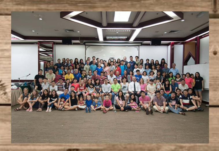
At the CERC Annual Camp 2017, which had as its theme, "Zion Founded on the Mountains"