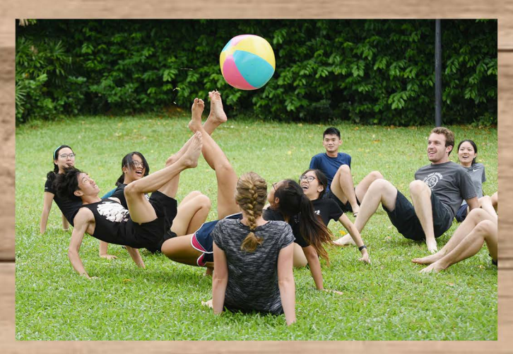
Playing "crab soccer" at the CKCKS (young people's) retreat