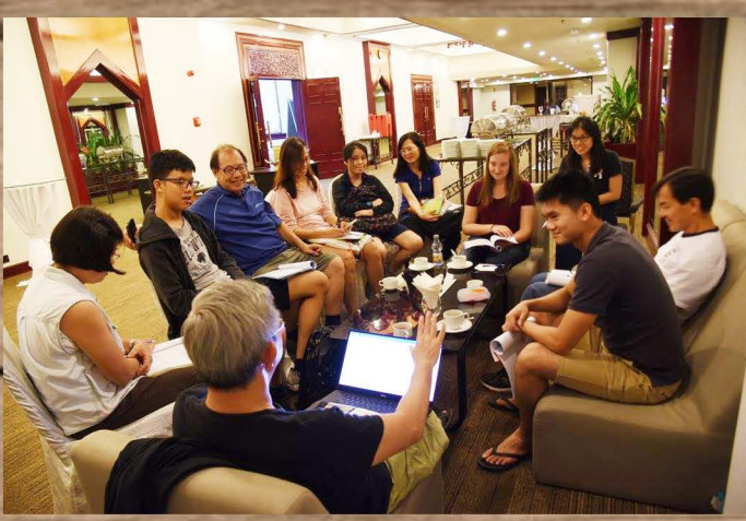
Group discussions were held after each of the four church camp speeches